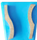
TW2134 Metal (S型金刚马蹄) :