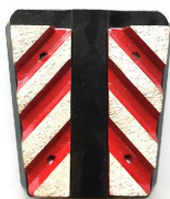
TW2122 Metal (铁底金刚马蹄) :