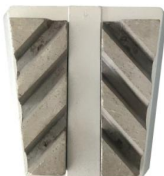
TW2121 Metal (铝底金刚马蹄) :