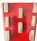
TW2132 Metal (直齿金刚马蹄) :