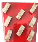
TW2131 Metal (斜齿金刚马蹄) :