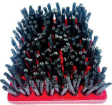
TW2321 Steel Wire Brush (钢绳马蹄刷) :