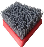
TW2331 Mixed Brush (混合马蹄刷) :