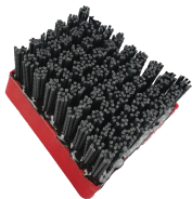
TW2341 Abrasive Brush (研磨马蹄刷) :