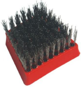
TW2311 Steel Brush (钢丝马蹄刷) :