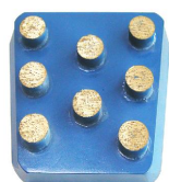
TW2133 Metal (圆齿金刚马蹄) :