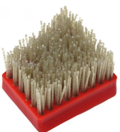
TW2351 Diamond Brush (金刚石马蹄刷) :