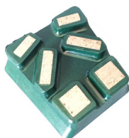
TW2111 Metal (胶木金刚马蹄) :